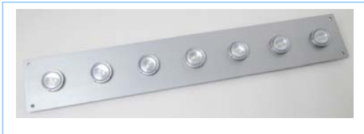
Model: LB7A 570 x 90 x 3 mm