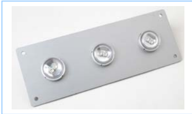
Model: LB3A 250 x 90 x 3 mm

BrightLite’s patent pending Ultra-BrightLite™ High Power LED lamps provide ease in maintenance, when individual LED Lamps replacement is necessary. The parallel connection eliminated total black out when one LED lamp is malfunctions.