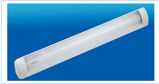
Model: DH4 & DH4-S 565 x 110 x 90 mm

BrightLite’s patent pending Ultra-BrightLite™ High Power LED lamps provide ease in maintenance, when individual LED Lamps replacement is necessary. The parallel connection eliminated total black out when one LED lamp is malfunctions.