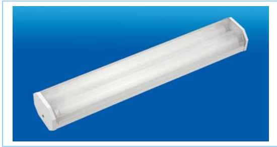
Model: DG4 & DG4-S 565 x 110 x 90 mm

BrightLite’s patent pending Ultra-BrightLite™ High Power LED lamps provide ease in maintenance, when individual LED Lamps replacement is necessary. The parallel connection eliminated total black out when one LED lamp is malfunctions.